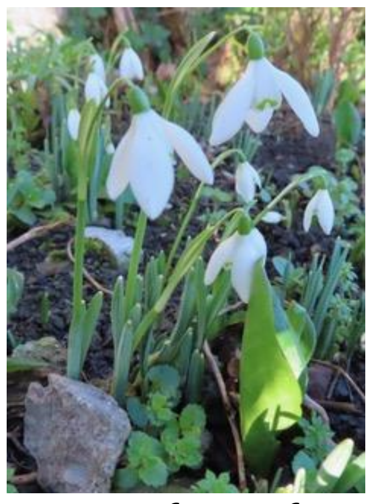
Issue 210 Feb- March 2024